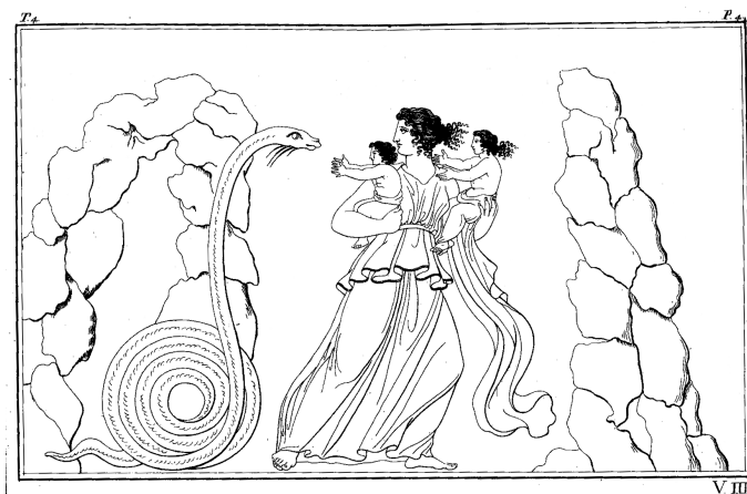
Fig. 1. Python challenges Leto, with babies Apollo and Artemis.

But it is the Classical world with which we are concerned here. The classical reflex of the dragon, the drakōn , was frequently associated with a spring. To begin with, let us consider three cases in which a drakōn is strongly presented as the guardian of a spring. First, in the Homeric Hymn to Apollo we learn that the baby Apollo killed the Delphic drakaina ('she-dragon') at a 'sweetly flowing spring', i.e. Castalia, probably (though Delphi boasted many springs) 5 . A spring appears too in association with her male counterpart Python in his relatively meagre iconography: in a (lost) Apulian amphora of the earlier fourth century BC, for example, we meet a coiling, rampant Python confronting Leto, her two babies in her arms, before two triangular stone structures: on the left, his cave, and on the right, the conical pile of stones representative of a spring (the twin peaks of Delphi's Phaedriades may also be evoked; fig. 1 ) 6 .