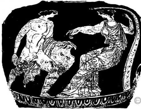
Fig. 2. The spring of Dirce, personified, offers to fill Cadmus' water-jar; the serpent lurks. Red-figure hydria, ca. 420–410 BC. Musée du Louvre M 12 = N 3325 = MN 714 = LIMC Kadmos i 18. Redrawn by Eriko Ogdén.

is also possible that is she knowingly and maliciously leading Cadmus into a trap, in close cahoots with her serpent guard. The model of action here may be akin to that found in the case of Dio Chrysostom's wonderful lamiai of Libya. These creatures are terrible serpents whose tails culminate in effigies of beautiful naked women. They ensnare their chosen food of vigorous young men by concealing themselves behind sand dunes and waving their tails seductively at passing victims. Once the men are thus attracted within range, they wheel round, grabbing them with the claws with which they are also endowed, envenom them and devour them 12 . If the reading of the vase and the comparandum given here are cogent, then it is suggested that there is a sort of identity between the spring and the serpent – something that will be more self-evidently true in the following cases we consider. The drakōn of Ares tale also constitutes our first example of a further phenomenon that will recur: the association between the slaying of a serpent and an act of foundation.