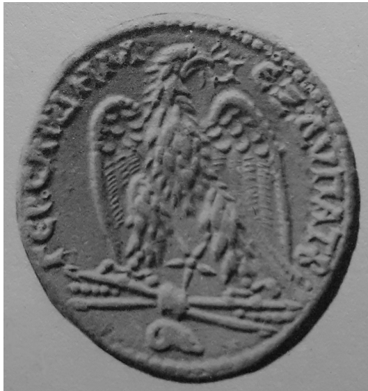
Fig. 5. Syrian coin of Marcus Aurelius (A. DIEUDONNÉ [1929], plate ii [iv] no. 18). Reverse: an eagle carries a thunderbolt.