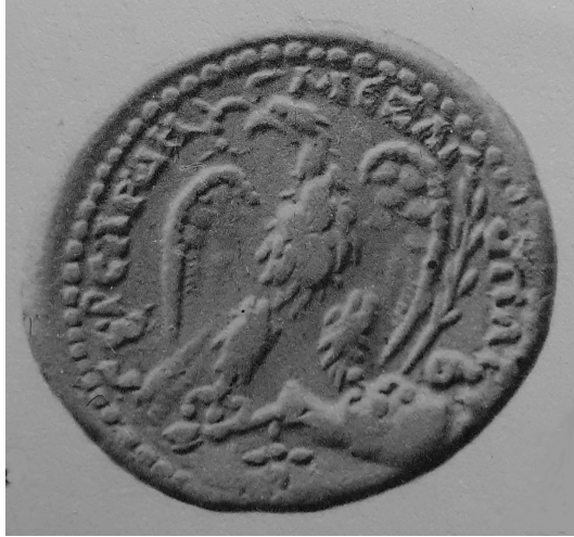
Fig. 4. Syrian coin of Marcus Aurelius (A. DIEUDONNÉ [1929], plate ii [iv], no. 16). Reverse: an eagle carries flaming ox-thigh.